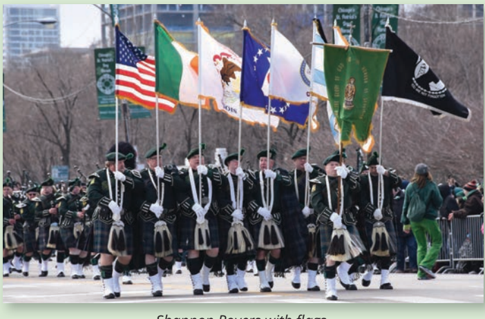
Shannon Rovers with flags.