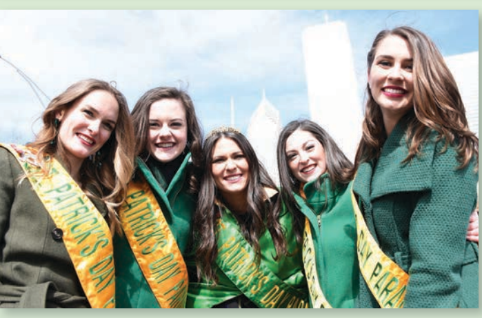
Parade Queen & girls with skyline.